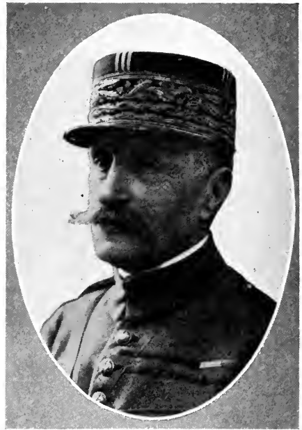
FIELD-MARSHAL FOCH, O.M., G.C.B.